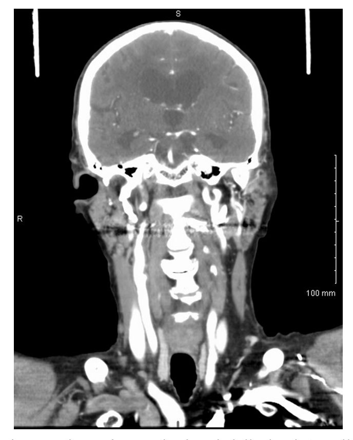
Fig. 3. A coronal CT scan of a patient with an elongated styloid hyoid complex.

length has a higher association with pain [11]. Incidences of abnormal stylohyoid length range from 4% to 7.3% [5,12]. The incidence is higher if calcification of the stylohyoid complex is included 22%–84% [13,14]. Despite the high incidence of abnormal stylohyoid complex, the incidence of pain associated with these abnormalities is 4–10% [15]. While stylohyoid abnormalities often occur bilaterally, pain usually presents unilaterally [10].