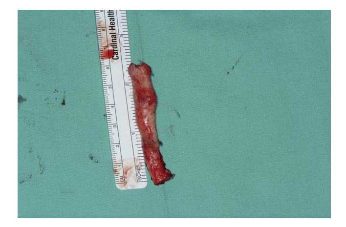
Fig. 4. Intraoperative view of excised styloid process in a patient with Eagle Syndrome.

An external, cervical approach provides the best exposure with the caveat of a scar. This approach begins with an oblique incision made at the angle of the mandible and dissection is carried down to the sternocleidomastoid muscle. The sternocleidomastoid is retracted posterolaterally. Subsequently the space between the parotid gland and the posterior belly of the digastric muscle is explored. The dissection is completed with subperiosteal dissection onto the styloid process and