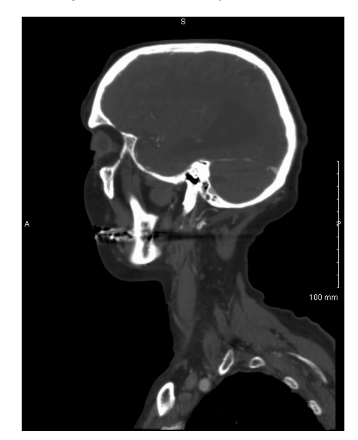
Fig. 2. A sagittal CT scan of a patient with an elongated styloid hyoid complex (We would like to acknowledge Dr. Roy Holliday from Mount Sinai Health System for providing these images).

There have been many studies since the identification of Eagle Syndrome that have sought to determine the incidence and prevalence