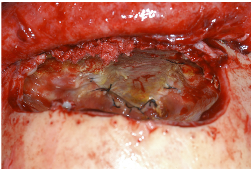
FIGURE 1. Intraoperative view of patient after resection of a skull base neoplasm, radiation, and an intractable cerebrospinal fluid leak with a necrotic pericranial flap.

In total 109 patients with intractable CSF leaks were identified. Eighty-eight patients underwent reconstruction with local flaps (septal, pericranial, temporalis). A subset of 11 patients (8 male, 3 female; average age, 49.5 yrs) underwent 11 intracranially placed free flaps (8 fascia-only radial forearm and 3 muscle-only rectus free