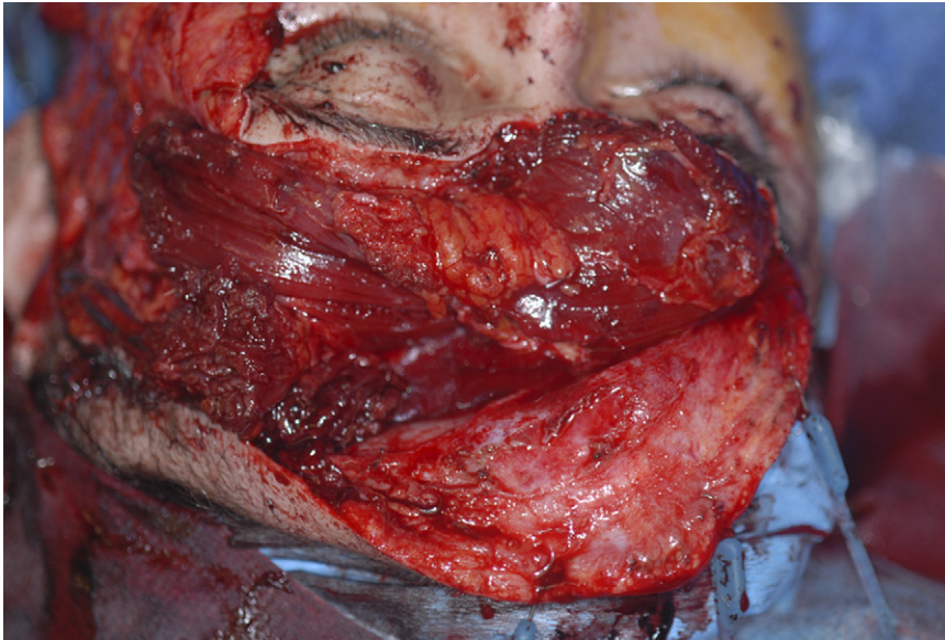
FIGURE 4. A rectus free flap has been placed intracranially to obliterate the dead space, protect the remaining brain, and close the cerebrospinal fluid leak.

Inman and Ducic. Intracranial Tissue Transfer for CSF Leaks. J Oral Maxillofac Surg 2012.