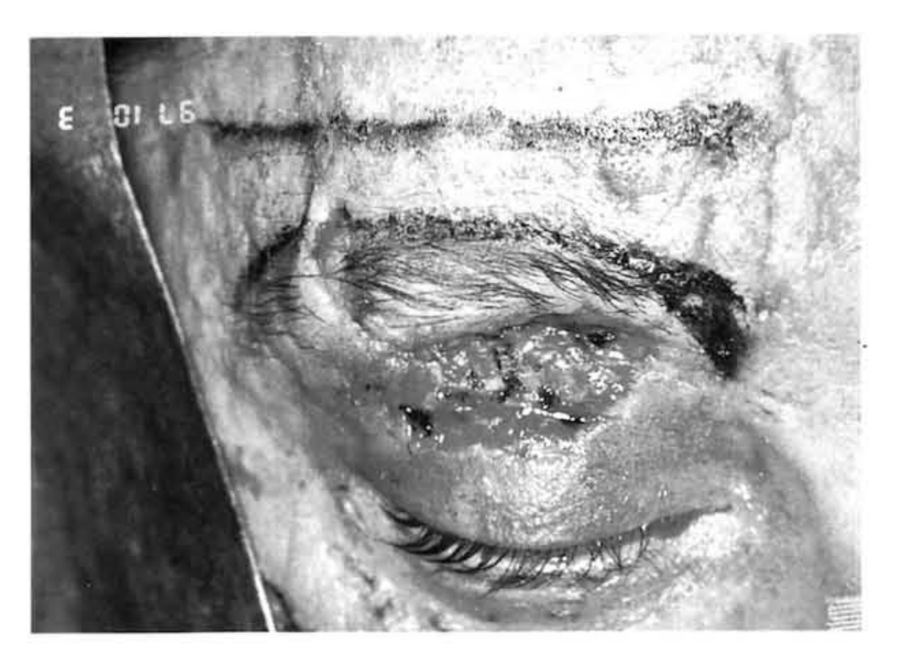
Fig. 2. Proposed outline of pedicled bucket handle brow flap. Note flaring medially and laterally.

We entertained a number of possibilities for reconstruction. We felt that his healing potential was quite poor due to the severity of his overall condition. Thus, we designed a local, pedicled flap which we felt was simple and expeditious to raise and inset, and, which we felt, maximized the potential vascularity of the transferred tissue. A bucket handle bipedicled flap of suprabrow skin was transferred onto the upper eyelid defect after conservative debridement and thorough irrigation of the tissues with copious amounts of sterile water solution. The inferior limb of the incision was made along the margin of the superior brow, bevel cutting it to avoid unnecessary trauma to the hair follicles (Fig. 2). The superior limb of the incision was made parallel and 1.5 cm superior to the inferior incision. The medial and lateral ends of the