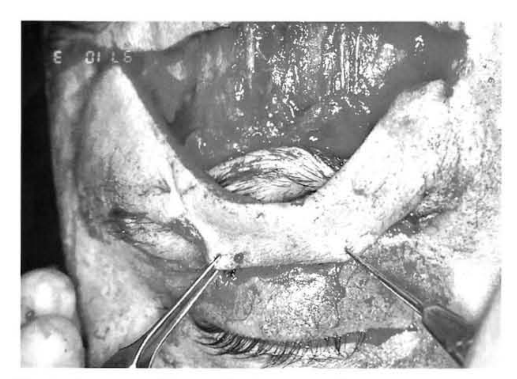
Fig. 3. Flap raised in a subcutaneous plane.