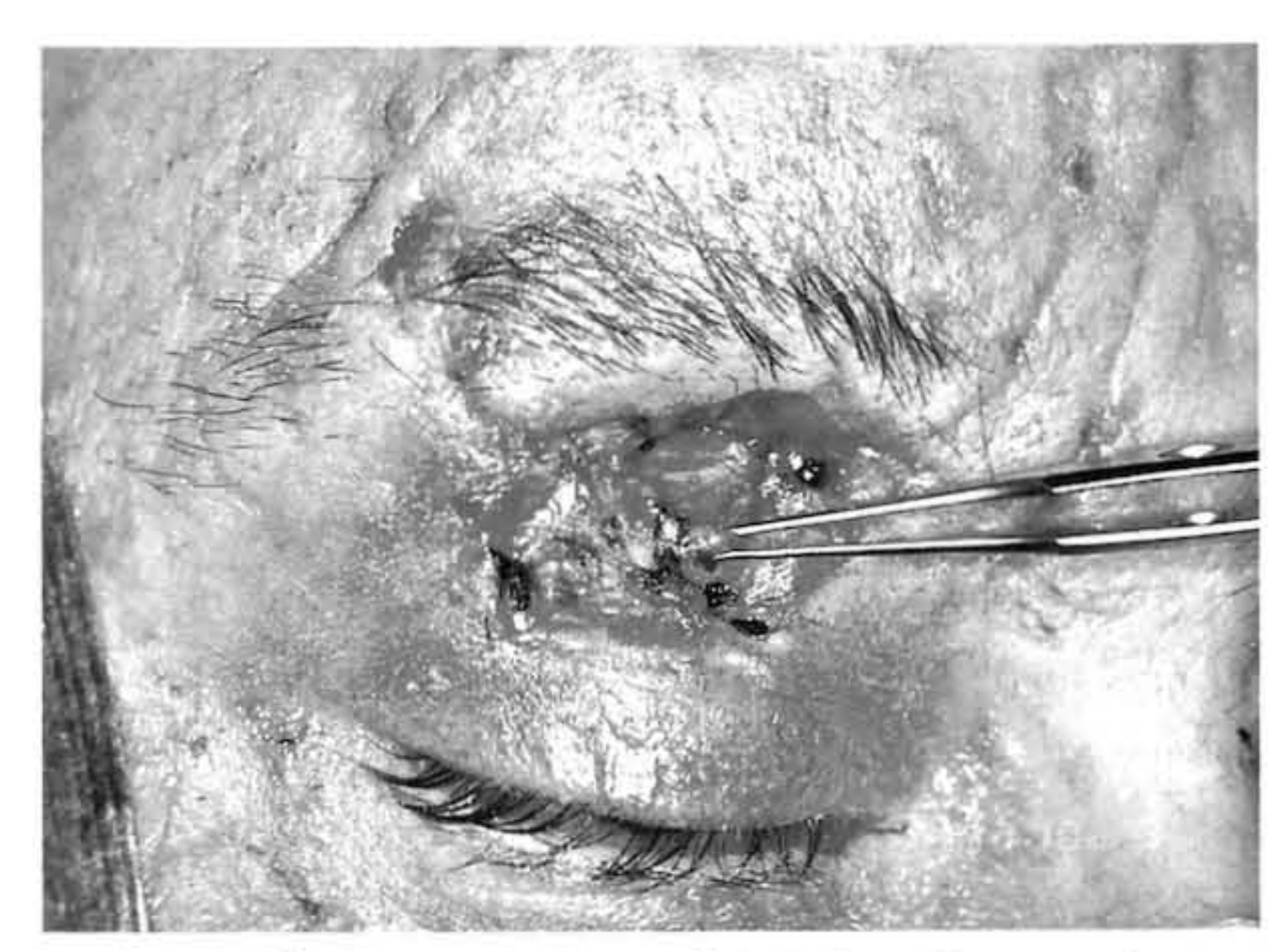
Fig. 1. Full thickness upper eyelid defect. Forceps demonstrating osseous exposure of the superior orbital rim.

After initial emergent treatment of his serious life-threatening injuries, the patient developed adult respiratory distress syndrome and a persistent intestinal fistula. Renal and hepatic function also adversely affected this patient.