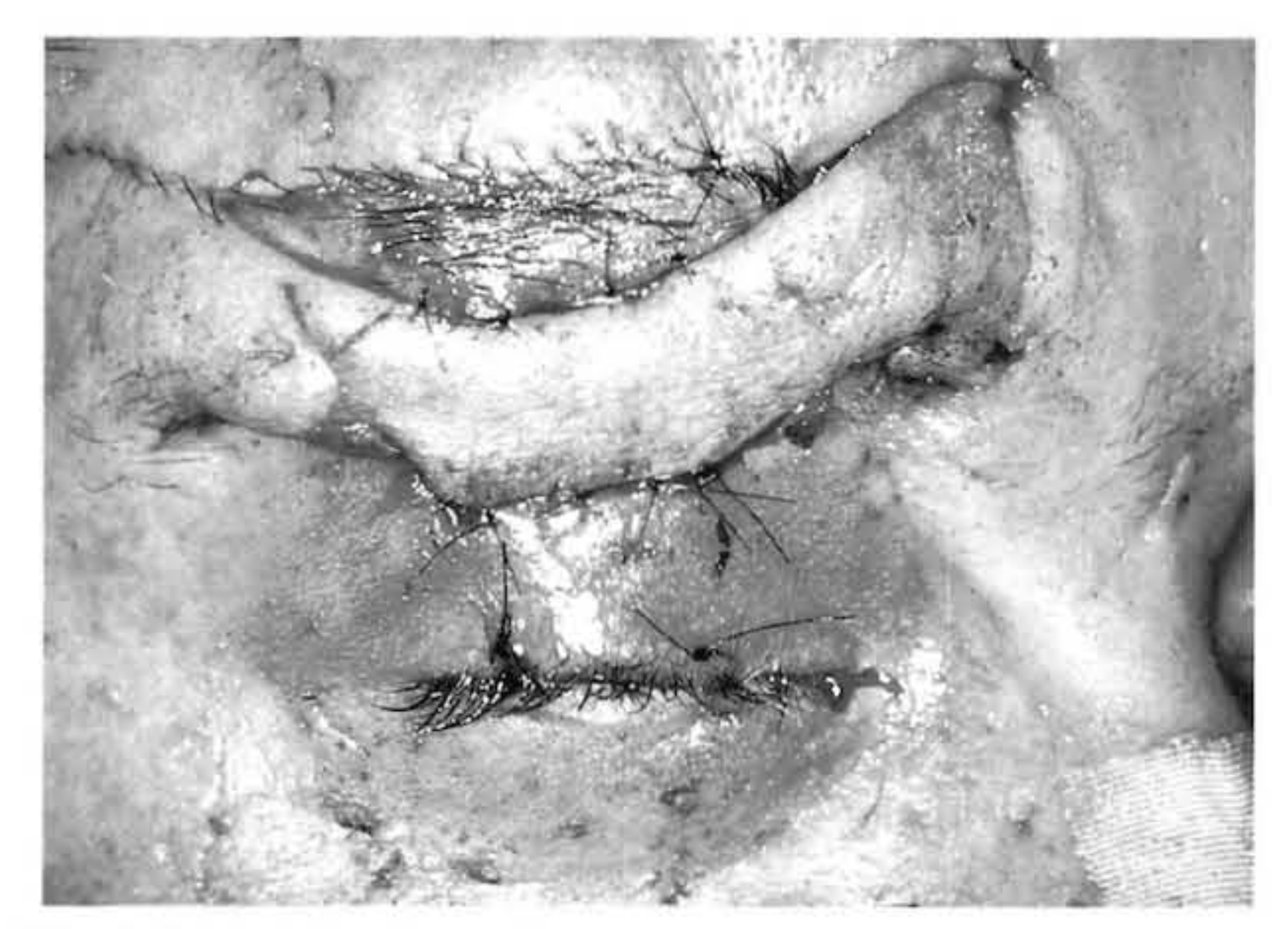
Fig. 4. Initial flap insetting.

Aesthetically, if the pre-existing periorbital lacerations are excluded, the final result after insetting is acceptable. The majority of the incision lies camouflaged within the superior margin of the brow, similar to that seen with a direct brow lift in cosmetic surgery. As with other pedicled forehead or temporal flaps used in eyelid reconstruction, the skin that is transferred is not of the same color or thickness as is normally found in the recipient area. Thus, this flap would ideally be suited for full-thickness upper eyelid defects. Split-thickness skin grafts from the contralateral upper eyelid are the preferred reconstructive modality for rehabilitation of partial thickness upper eyelid defects. However, if there is concern regarding the patient's healing potential (e.g., heavy smokers, diabetes mellitus,