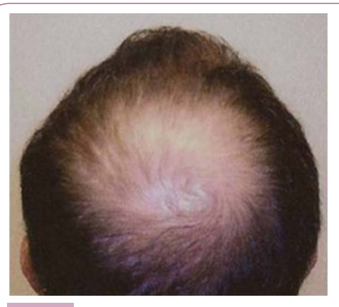
Figure 2 Male patient with baldness at the vertex.