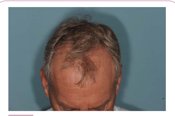
Figure 1 Typical male pattern baldness.

The strip is then separated into fine slivers about 2 to 3 follicular units wide. This is performed under a microscope or with magnification. The individual slivers are then sliced into individual follicular units and separated into piles based on the number of terminal hairs. The grafts are then implanted into the recipient sites with careful attention paid to the direction of hair growth and placement to ensure a natural appearance. Recipient sites are created with needles or specialized scalpels. Single hairs are generally placed along the hair line for a more natural look. Using