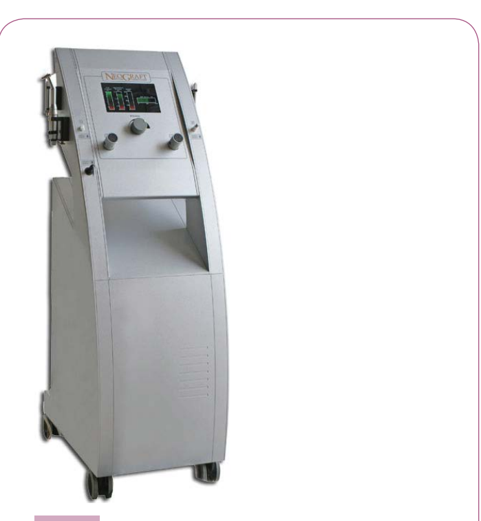
Figure 8 NeoGraft machine used for follicular unit extraction.

Platelet-rich plasma (PRP) contains growth factors that have been shown to improve wound healing [29]. PRP is an emerging trend in hair restoration as a way to improve graft survival, increase hair yield rate, increase hair density and diameter [30]. Miao et al demonstrated significant hair growth in hairless mice when PRP